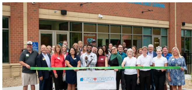
Casa de Corazon New Business