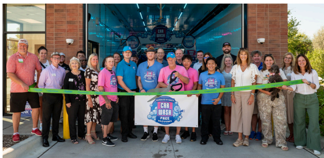
Bubbles N Vacs Express Car Wash New Business

The Chamber provides ribbon cuttings for new businesses in the community who join the chamber as well as for members celebrating a 10+ year milestone business anniversary, moved to a new business location or completed major renovation.