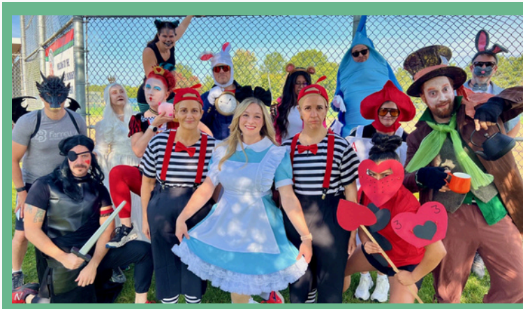
BEST DRESSED TEAM FARRELL'S EXTREME BODYSHAPING