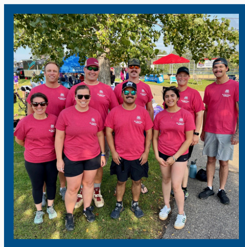
RUNNER UP TEAM MARATHON