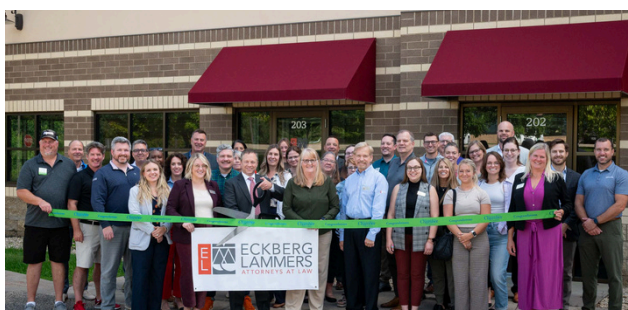
Eckberg Lammers New Oakdale Location