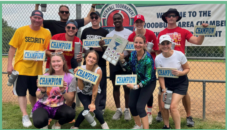
2025 TOURNAMENT WINNER NORTHWESTERN MUTUAL LAKE ELMO