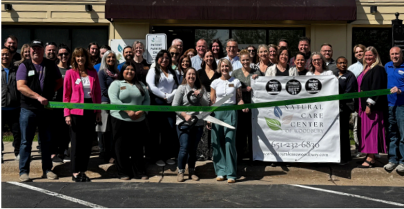
NATURAL CARE CENTER 25th Anniversary 10150 City Walk Drive Suite F, Woodbury

The Chamber provides ribbon cuttings for new businesses in the community who join the chamber as well as for members celebrating a 10+ year milestone business anniversary, moved to a new business location or completed major renovation.