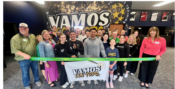
VAMOS CON TODO SOCCER TRAINING 690 Commerce Drive Suite 180, Woodbury