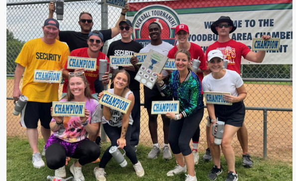
2025 CHAMPIONS NORTHWESTERN MUTUAL LAKE ELMO