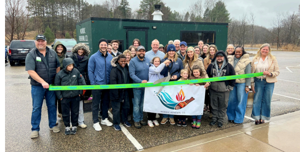
NORDIC RENEWAL CO. Mobile Sauna Experience Nordic Center Lake Elmo Park Reserve