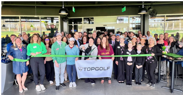
TOPGOLF WOODBURY 560 Bielenberg Drive Woodbury