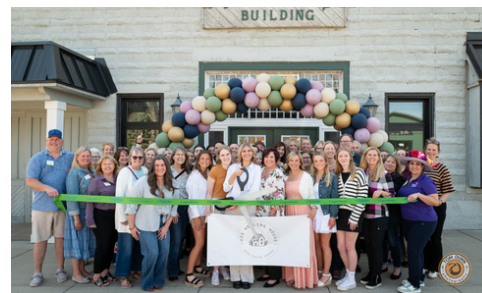
HIS HEALING HOUSE 3394 Lake Elmo Ave. Suite 2, Lake Elmo