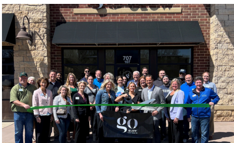
GOGLOW 707 Bielenberg Drive Suite 107, Woodbury