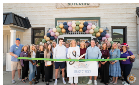
STEADY STRIDES 3394 Lake Elmo Ave. Suite 6, Lake Elmo