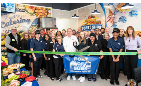
PORT OF SUBS 8362 Tamarack Village Suite 112, Woodbury