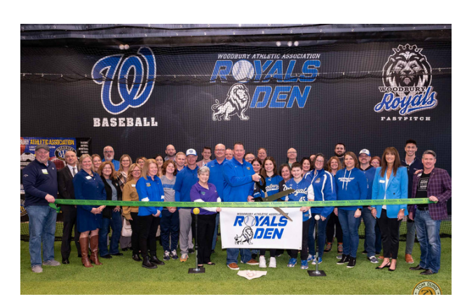
WOODBURY ATHLETIC ASSOCIATION New Indoor Facility 451 Commerce Drive, Suite 400 Photo Credit: Tom Dunn

BERNICKE WEALTH MANAGEMENT New Business 1625 Radio Drive, Suite 110 Photo Credit: Tom Dunn