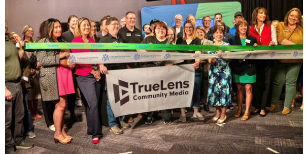
TRUELENS COMMUNITY MEDIA New Location 8595 Central Park Place Suite 200, Woodbury