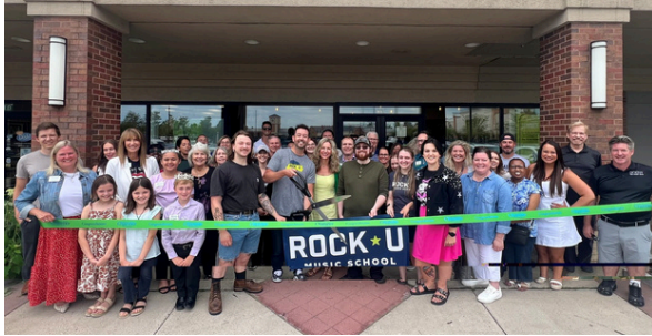
ROCK U MUSIC SCHOOL Anniversary 10150 Hudson Road Suite 111, Woodbury

The Chamber provides ribbon cuttings for new businesses in the community who join the chamber as well as for members celebrating a 10+ year milestone business anniversary, moved to a new business location or completed major renovation.