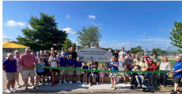
WOODBURY ROTARY CLUB MIRACLE FIELD SHADE STRUCTURE 4125 Radio Drive Woodbury