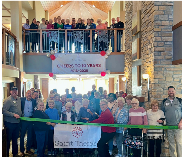
Saint Therese of Woodbury 10 Year Anniversary 7555 Bailey Road Woodbury